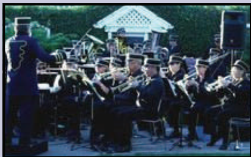
The Gottschalk Concert Band

The band usually plays what people would consider as "classical" music. In reality this group can put on a variety of shows ranging from a pops concert, themed concerts, operatic concerts and what lately has been the most popular kind of concert; a Sousa concert! The Sousa concert is basically the music of John Philip Sousa, America's "March King" and one of it's most prolific composers. This is a very patriotic concert and would make any gathering a simply unforgettable event! Depending on your needs, the Gottschalks Concert Band can range in size from a small wind ensemble of 20 to a large concert band of 50 musicians.