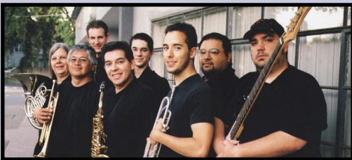
The Latin Jazz Orchestra

This group has performed with some of the hottest Latin musicians in the state and the country, including Ernie's very good friend Arturo Sandoval. The Latin Jazz Orchestra has performed at various festivals and venues including being a featured group at the 2006 Sacramento Jazz Jubilee.